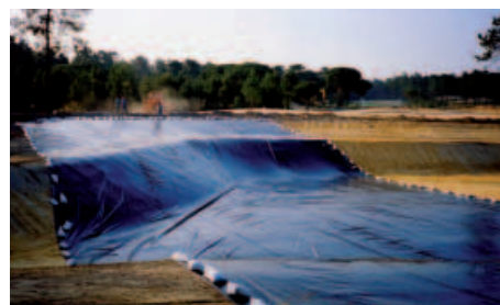
Left Sewerage Pond Saudia Arabia