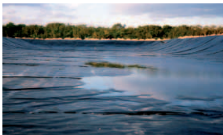
Right Storage Reservoirs China