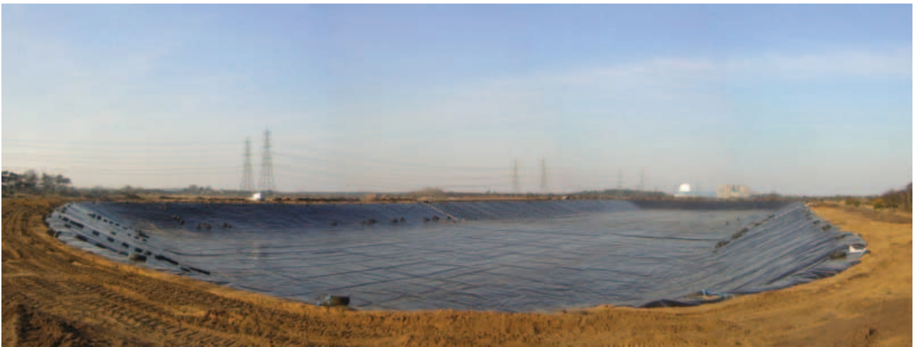
Irrigation Reservoir East Anglia