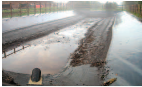
Right Irrigation Reservoir Kent