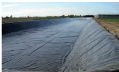
Right Irrigation Reservoir Worcestershire