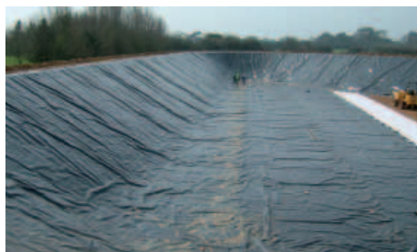
Right Slurry Lagoon Somerset