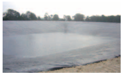
Left Irrigation Reservoir Oxfordshire