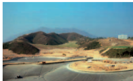
Left Treatment Lagoons Ireland