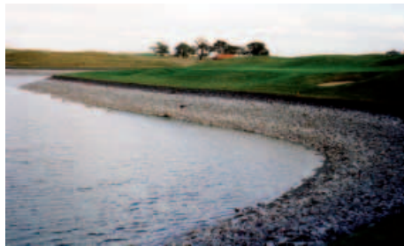
Right Slurry Reservoir Hampshire