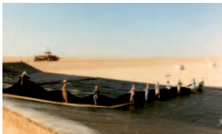
Right Toxic Waste Lagoon Spain