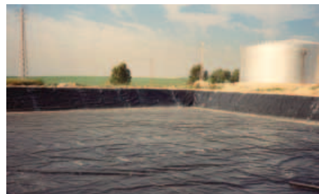
Left Solar Evaporation Lagoon Oman