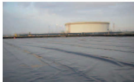
Left Fire Fighting Lagoon Papua New Guinea