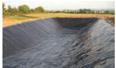
Left Irrigation Reservoir Hampshire