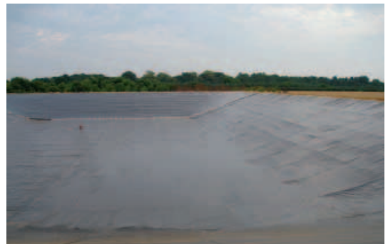
Photo references, top to bottom Settlement Lagoon Isle of Wight Lagoon West Sussex Slurry lagoon Wiltshire Irrigation Reservoir Suffolk

Fully lined earth structure awaiting filling. If required a geotextile overlay can be added to allow landscaping / soil covering.