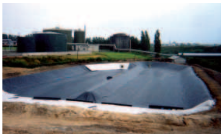
Right Tank Bund Lining Kazakhstan