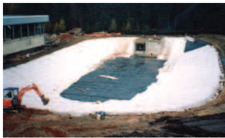
Right Irrigation Reservoir Norfolk