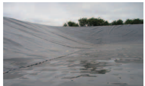
Left Irrigation Reservoir West Sussex