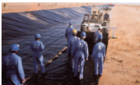
Right Secondary Containment Lining Ascension Island