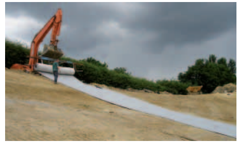
Left Waste Water Lagoon Herefordshire