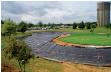
Right Celtic Manor Resort South Wales