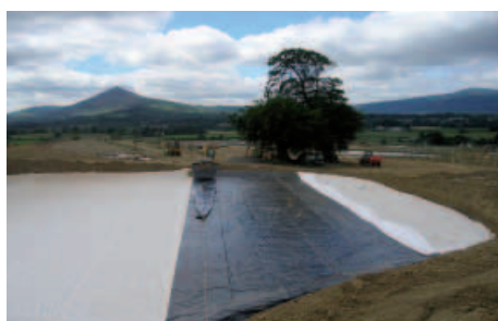
Right Killarney Golf & Fishing Club Ireland