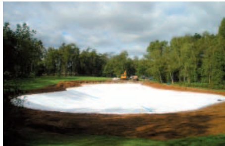
Right High Legh Park Golf Club Cheshire