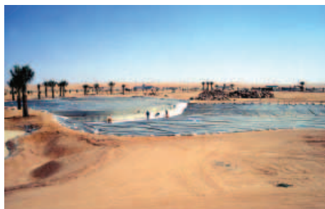
Right Brunnthal Golf Course Germany