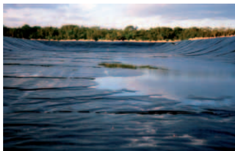
Right Discovery Bay Golf Club China