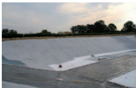
Right The Oxfordshire Golf Club Oxfordshire