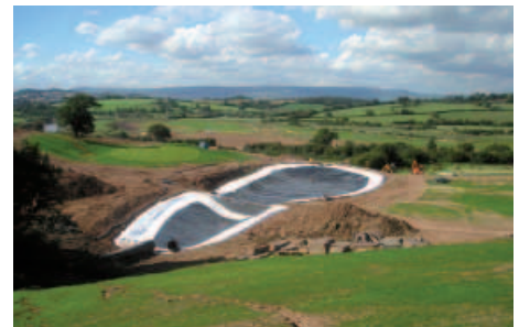
Left Enville Golf Club Staffordshire