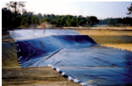
Right Frilford Heath Golf Club Oxfordshire