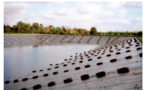
Left Moatlands Golf Club Kent