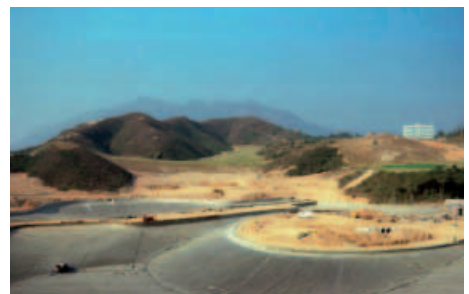
Left Dun Laoghaire Golf Course Ireland