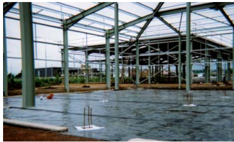
Right Gas Barrier Membrane Cumbria