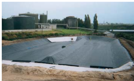
Right Settlement Lagoon Australia