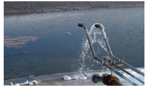
Left Reservoir Roof Lining Devon