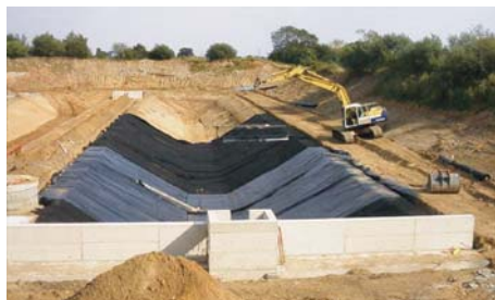
Right Evaporation Lagoon Australia