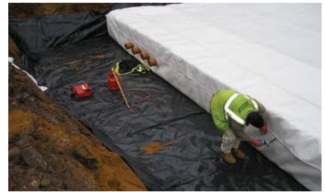
Left Contaminated Land Capping Berkshire