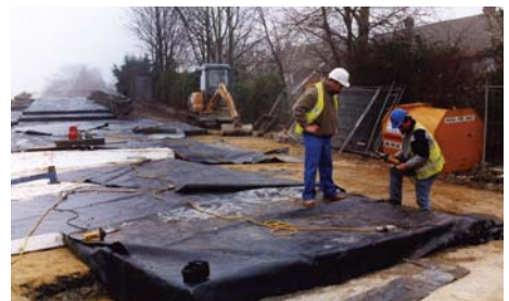
Left Toxic Waste Lagoon Tyne and Wear