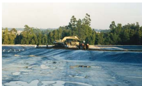
Right Slurry Lagoon Hampshire