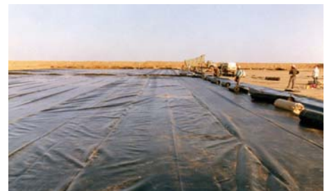
Left Evaporation Lagoon Saudi Arabia