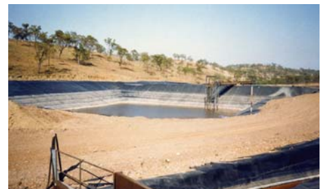
Left Sewage Treatment Lagoon Portugal