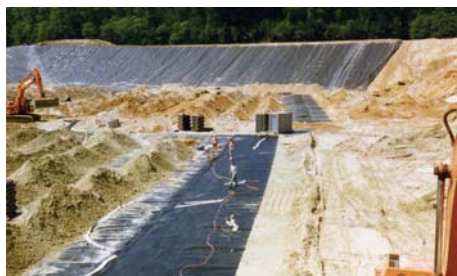
Right Reed Bed Lining Northamptonshire