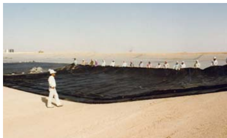
Right Fire Fighting Lagoon Papua New Guinea