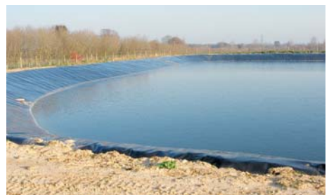
Left Lake Lining Surrey