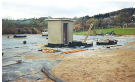
Right Secondary Containment Ascension Island