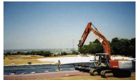
Left Cooling Lagoon Yorkshire