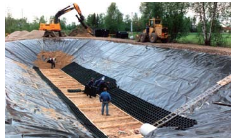
Left SUDS Lining Devon