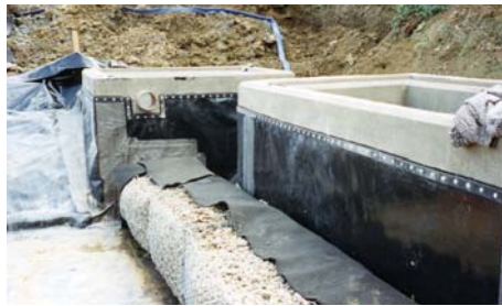
Right Reservoir Lining Gwent