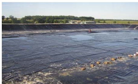
Right Industrial Lagoon Norfolk