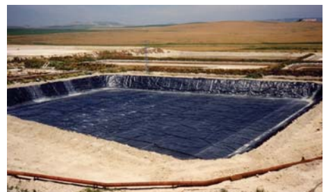
Left Waste Water Treatment Lagoon Yorkshire