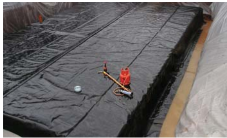
Right Attenuation Tank Hertfordshire