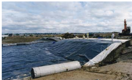
Right Contaminated Land Capping Kent