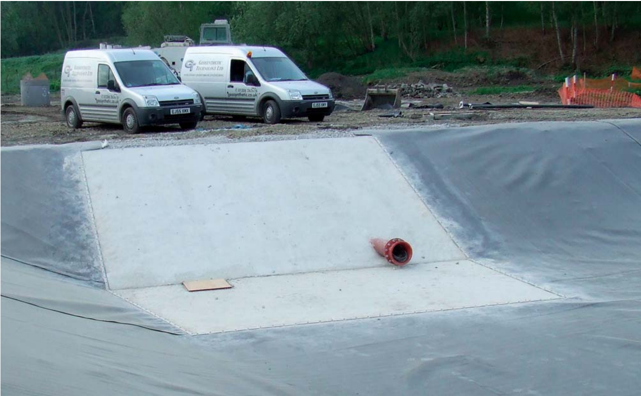
Drainage Lagoon Yorkshire