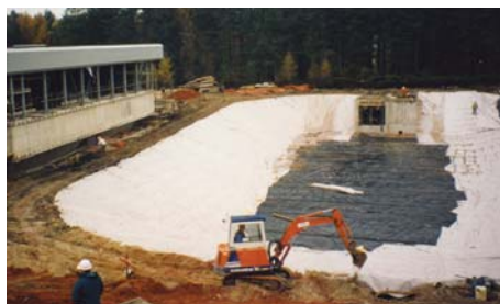
Right Waste Water Treatment Lagoon Staffordshire