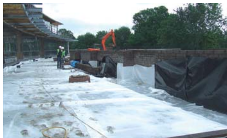
Right Structural Waterproofing Kent