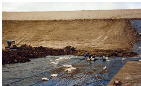
Right Waste Storage Lagoon Spain