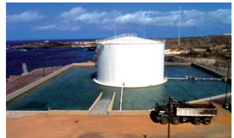
Left Secondary Treatment Ireland