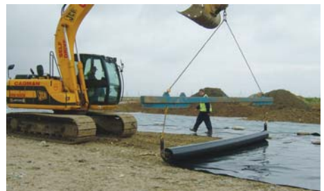
Left Landfill Cell Lining Belgium