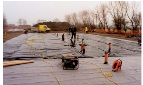
Left Industrial Lagoon Hampshire