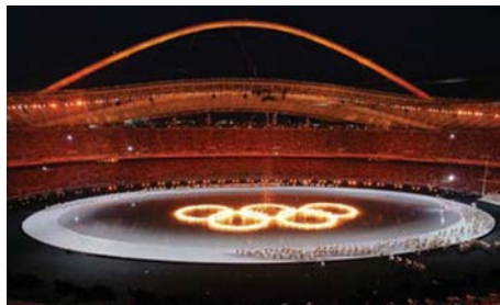
Right Storm Water Pond Finland